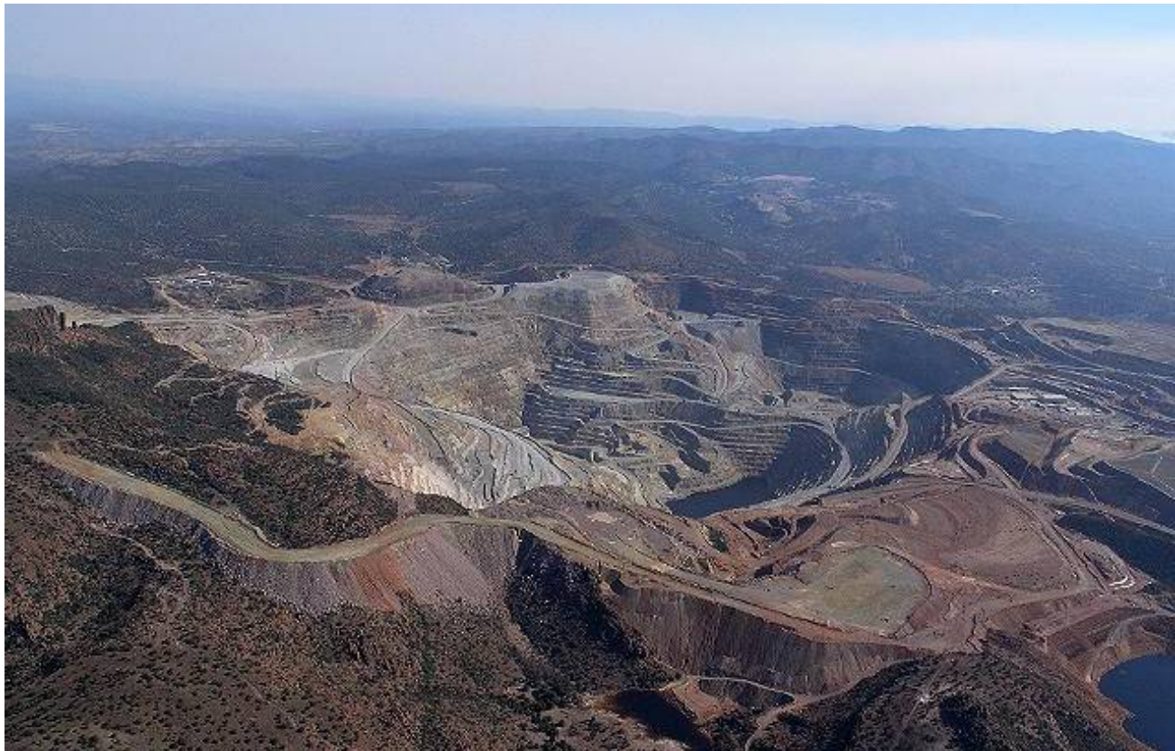
Chino Copper Mine - Aerial View