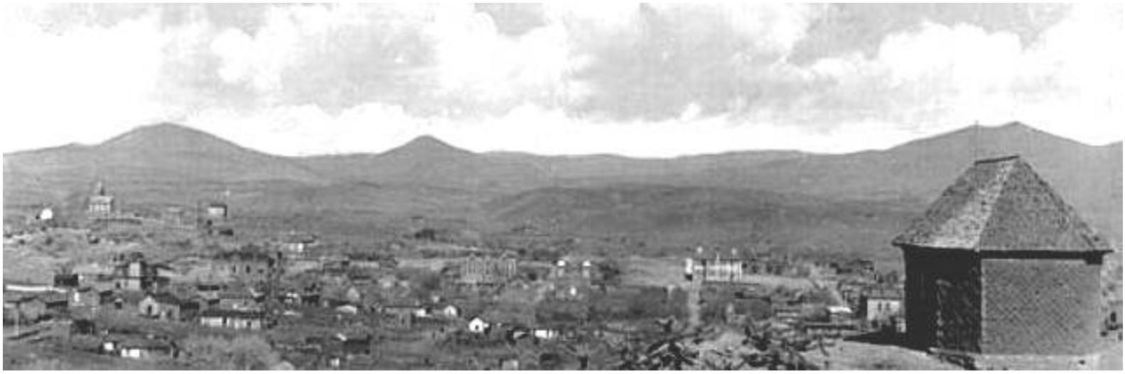
Silver City, New Mexico - ca. 1880