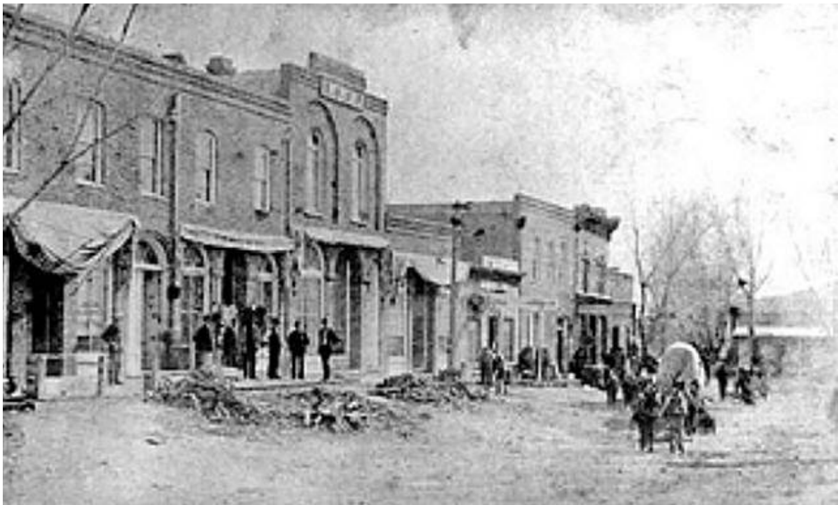
Silver City, New Mexico 1879