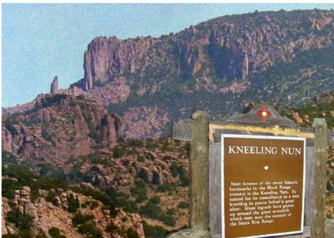
The Kneeling Nun Near Chino Copper Mine