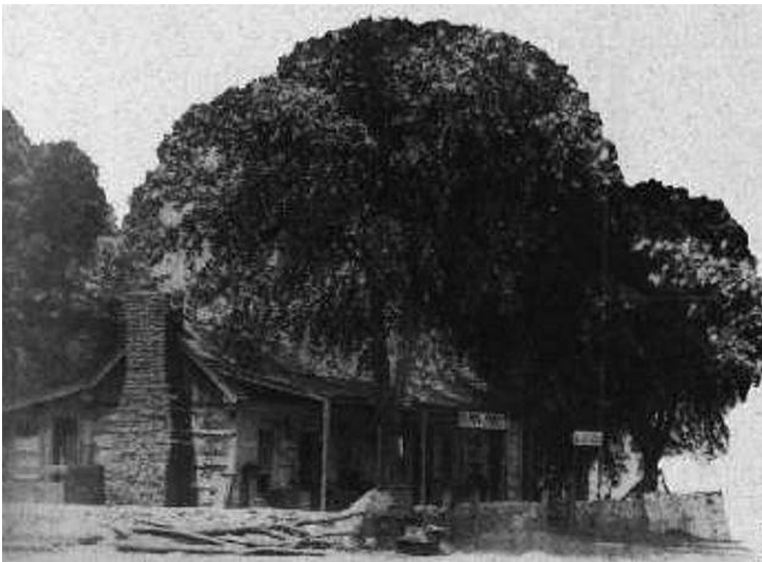
Billy the Kid's Childhood Home - ca. 1875-83