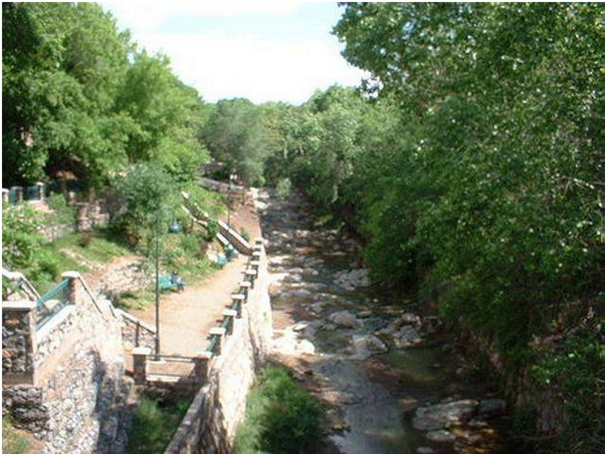
The Big Ditch, Silver City