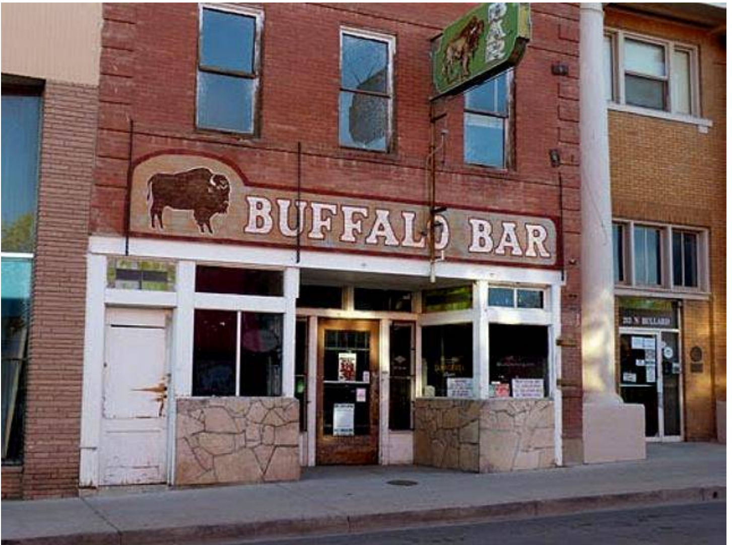
Buffalo Bar - Silver City