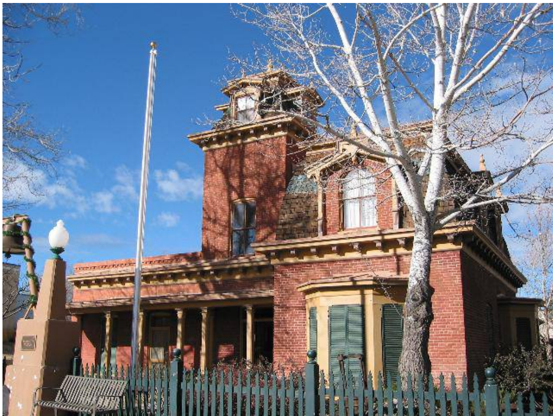
H. B. Ailman House, built in 1881, is now The Silver City Museum