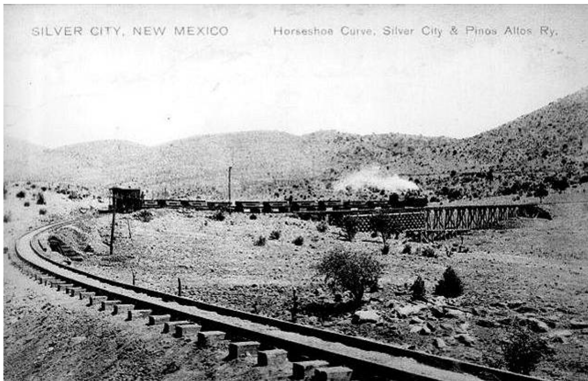
Horseshoe Curve - Silver City & Pinos Altos Railway