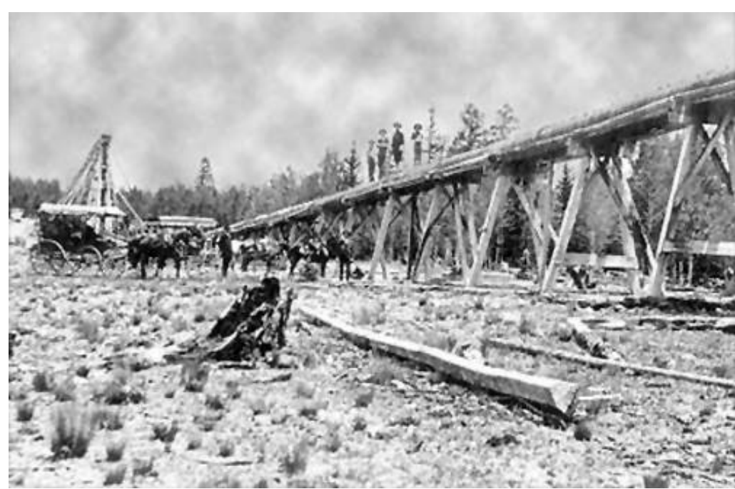
Big Ditch Flume, Elizabethtown, NM