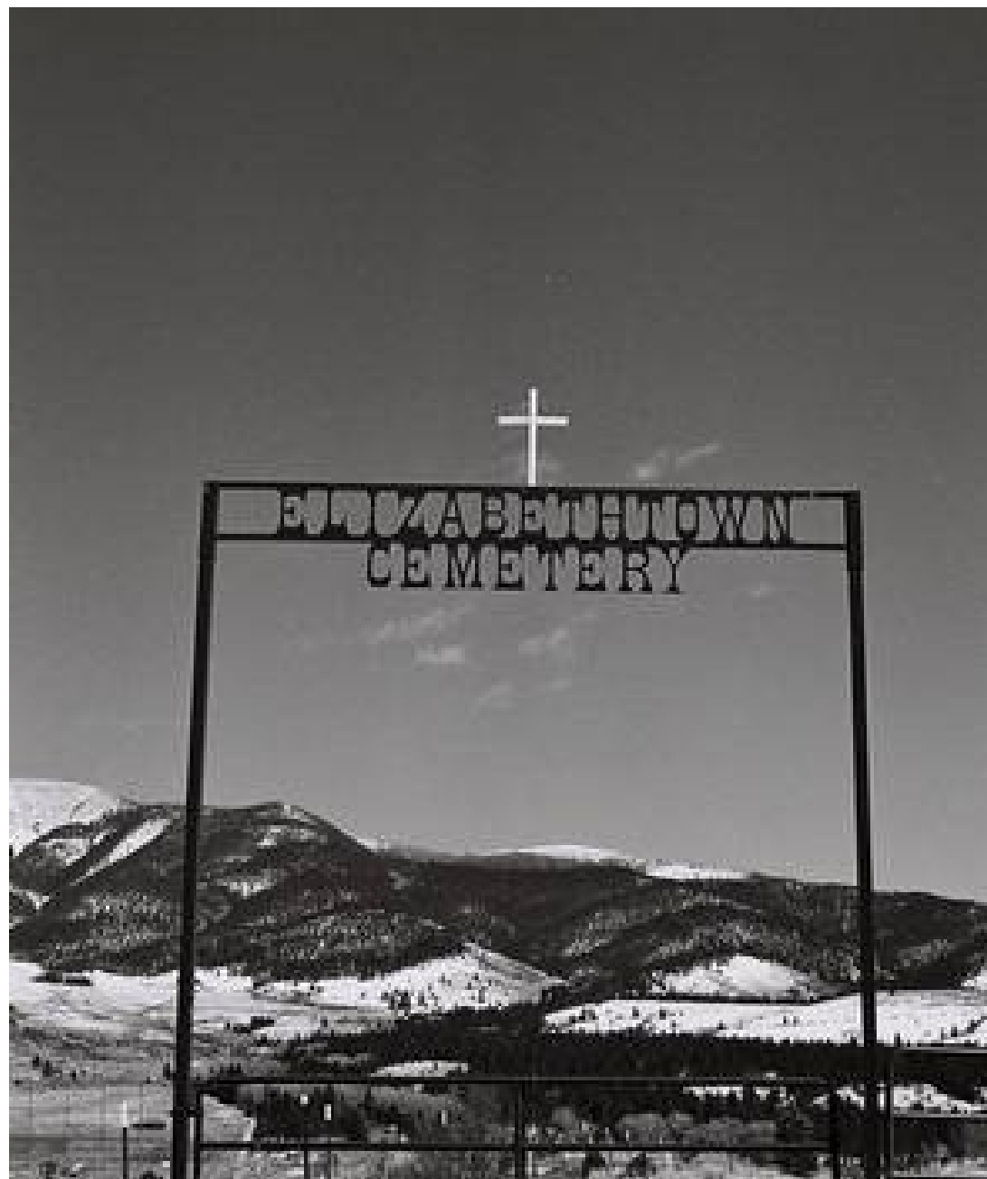
Elizabethtown Cemetery