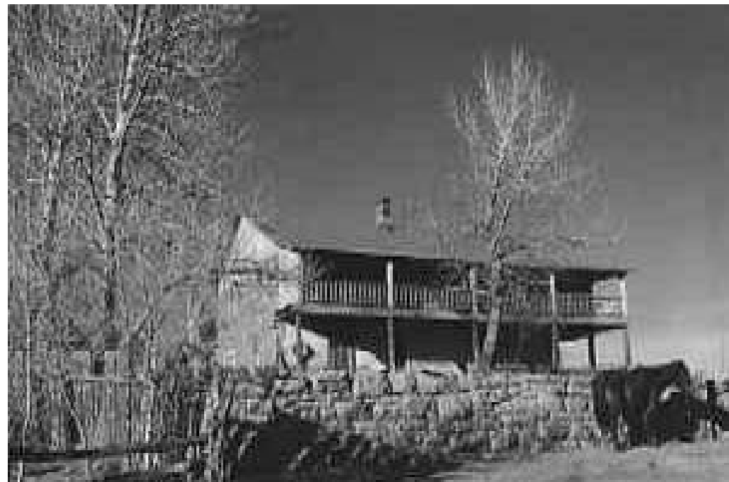
Mutz Farmhouse built in 1870