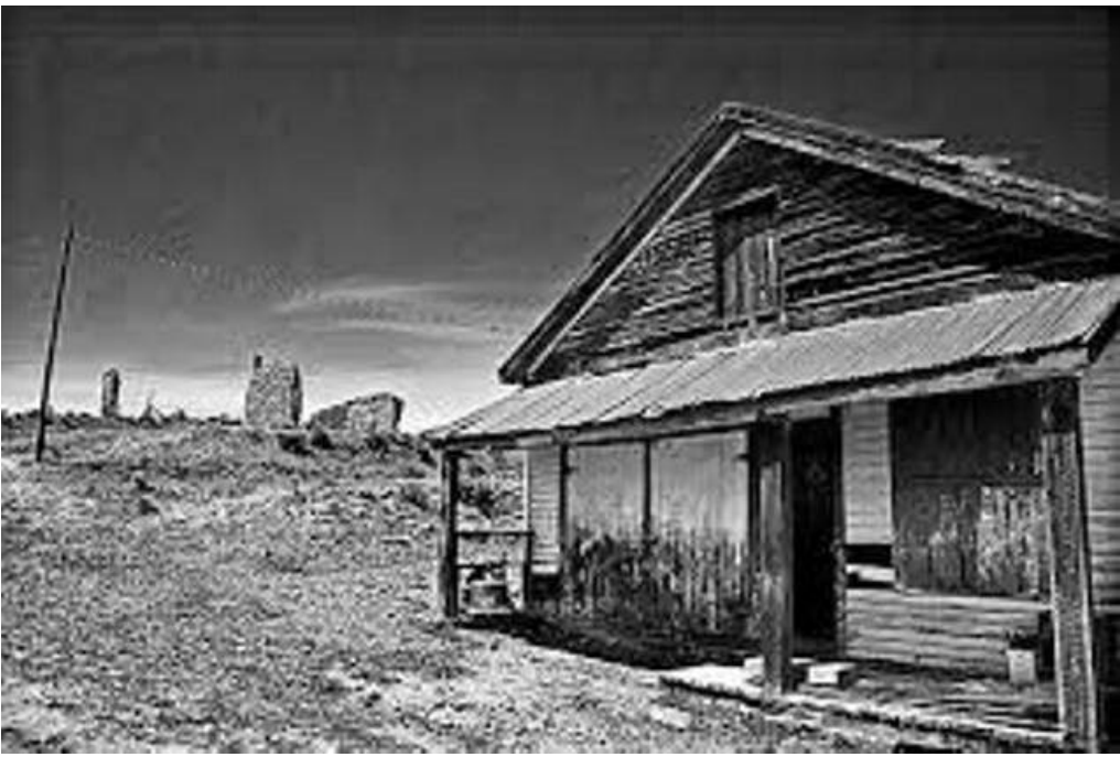
Farm House with Elizabethtown Mutz Hotel Ruins in Background