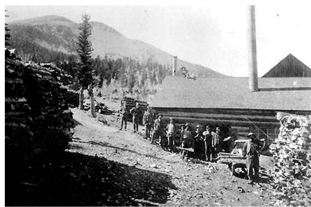
Red Bandanna Mine, Mt. Baldy Source Unavailable