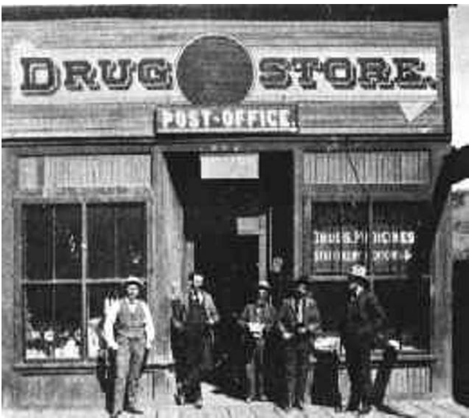
Elizabethtown Drug Store & Post Office