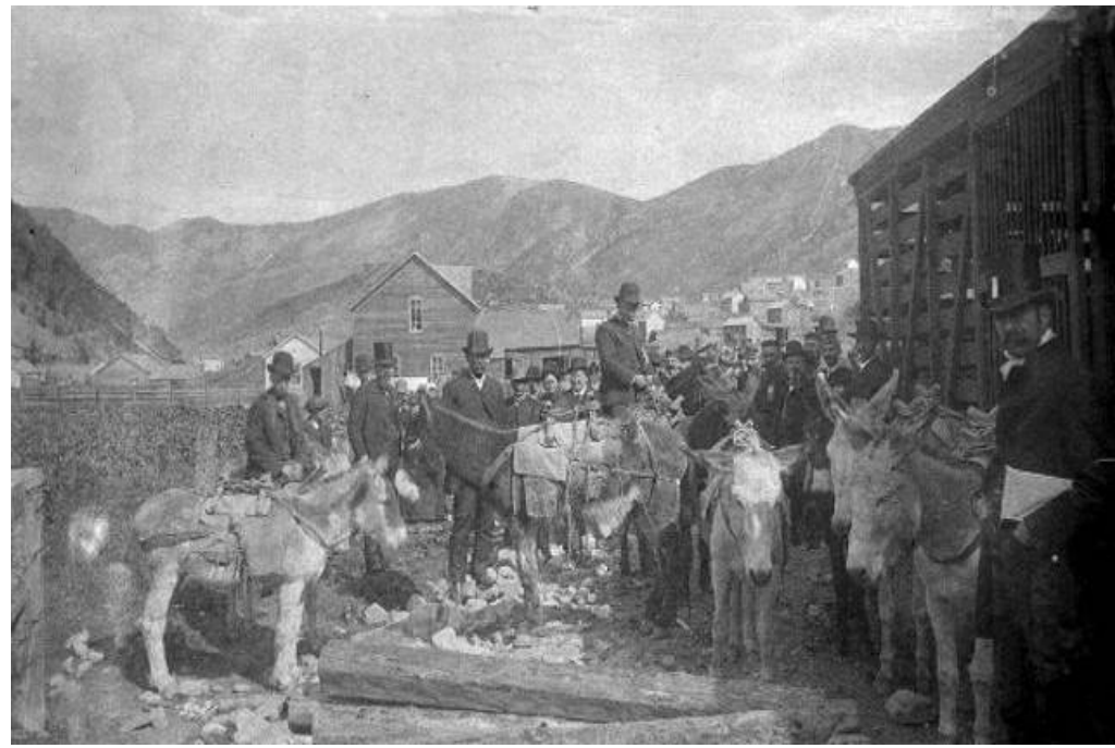
Burro Pack Train, Elizabethtown, NM - 1878