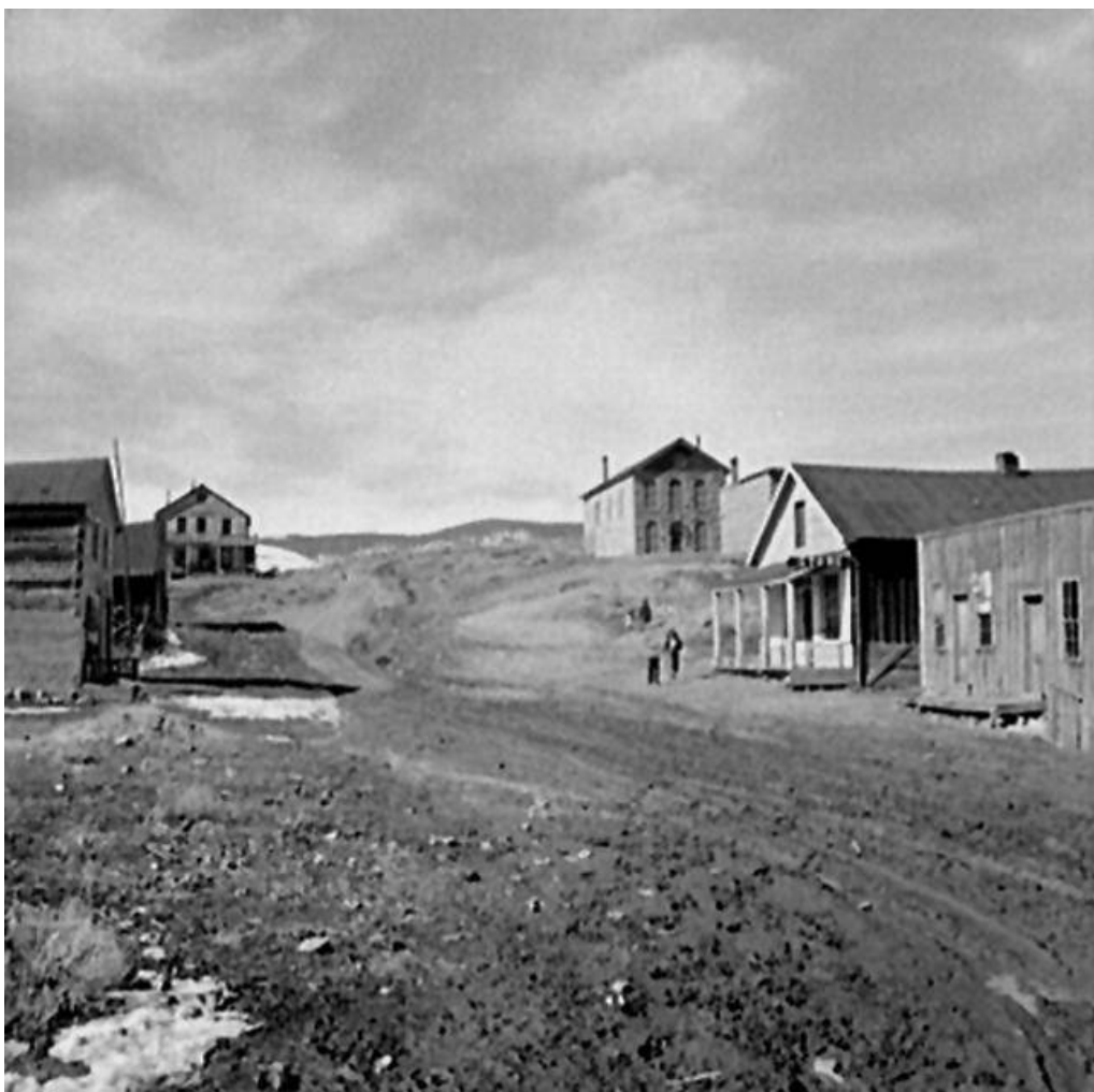
Elizabethtown, NM -1943